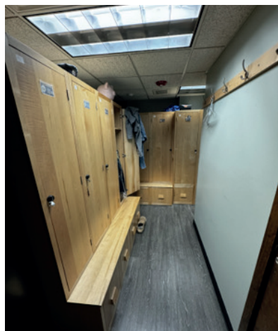
Men's Locker Room Police Department