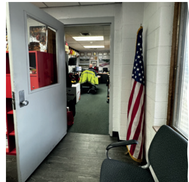
Chief's Office Fire Department