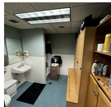
Women's Locker Room Police Department